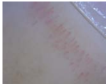
Capillary with resolution oils