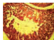
• Eye rabbit testis