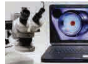
• AM423 with eyepiece