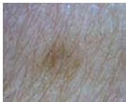
Skin without polarized