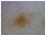
Skin with polarized