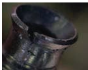
Turn Polarize on