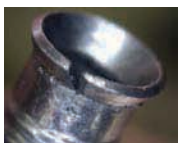
Turn Polarize off