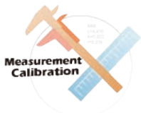
Measurement and Calibration Capabilities