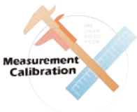
Measurement and Calibration Capabilities